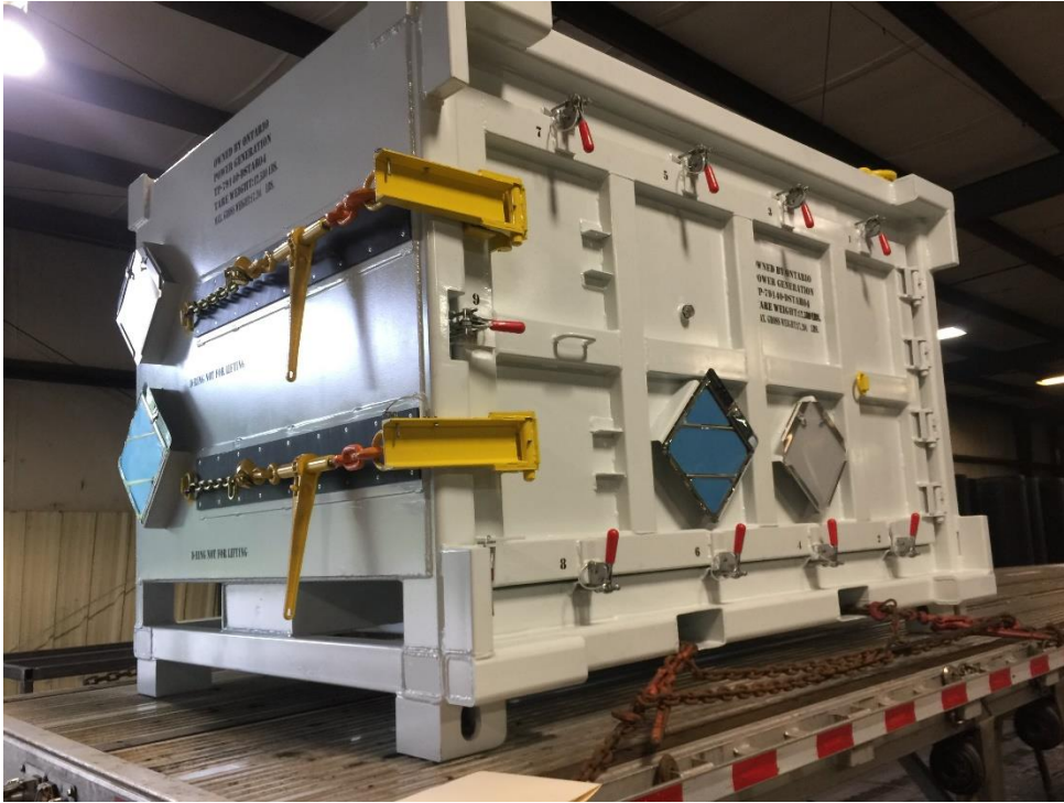
CTI MANUFACTURED PRODUCT OVERPACK WITH SHIELDING